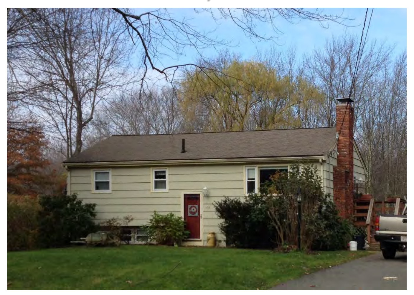
1 Affordable Ownership Unit DHCD ID 15