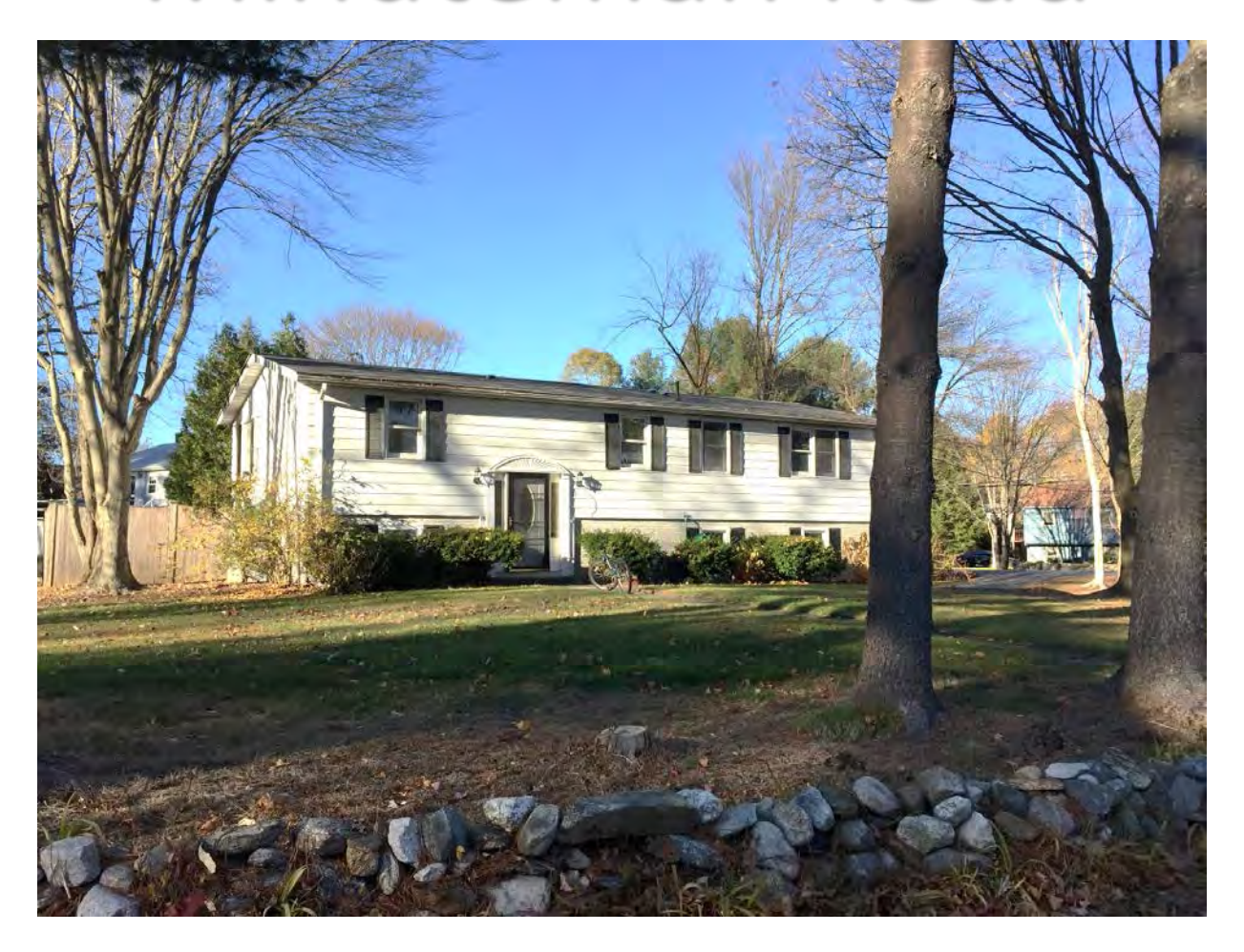
1 Affordable Ownership Unit DHCD ID 18