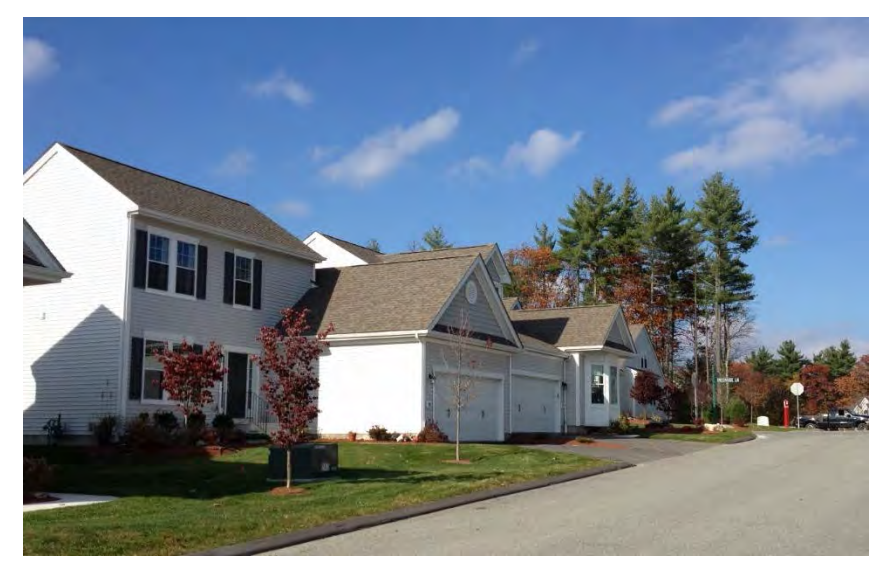
Great Road 3 Affordable Ownership Units DHCD ID 9656