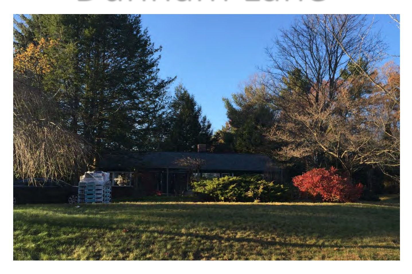
1 Affordable Ownership Unit DHCD ID 7160