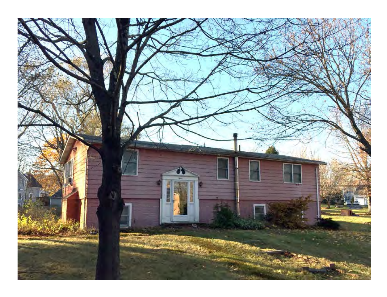
1 Affordable Ownership Unit DHCD ID 19