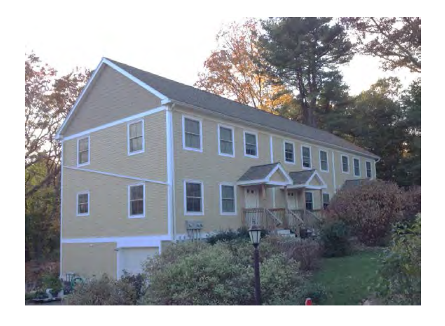
442 Massachusetts Avenue2 Affordable Ownership UnitsDHCD ID 9192