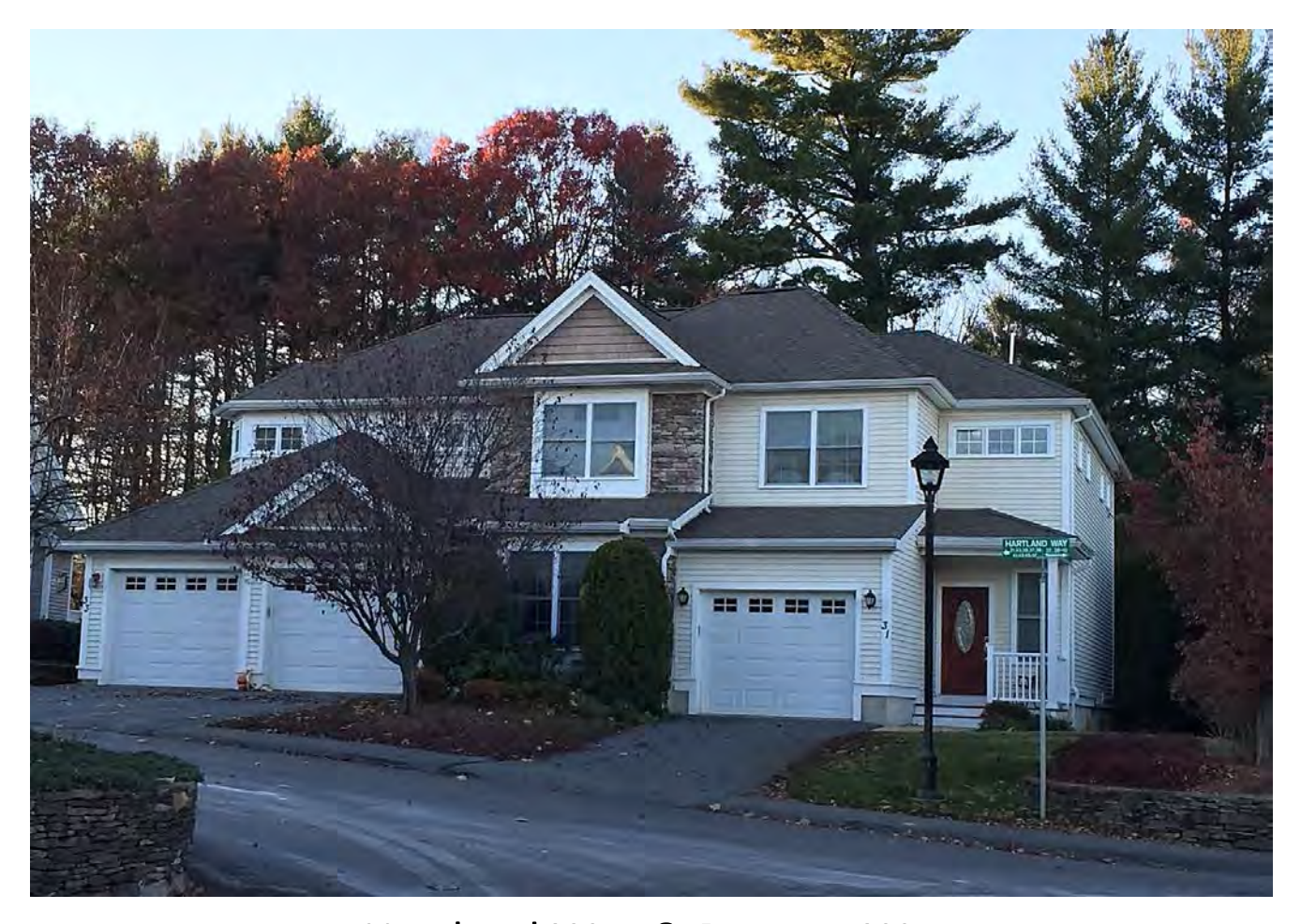
Hartland Way & Preston Way 1 Affordable Ownership Unit DHCD ID 7930