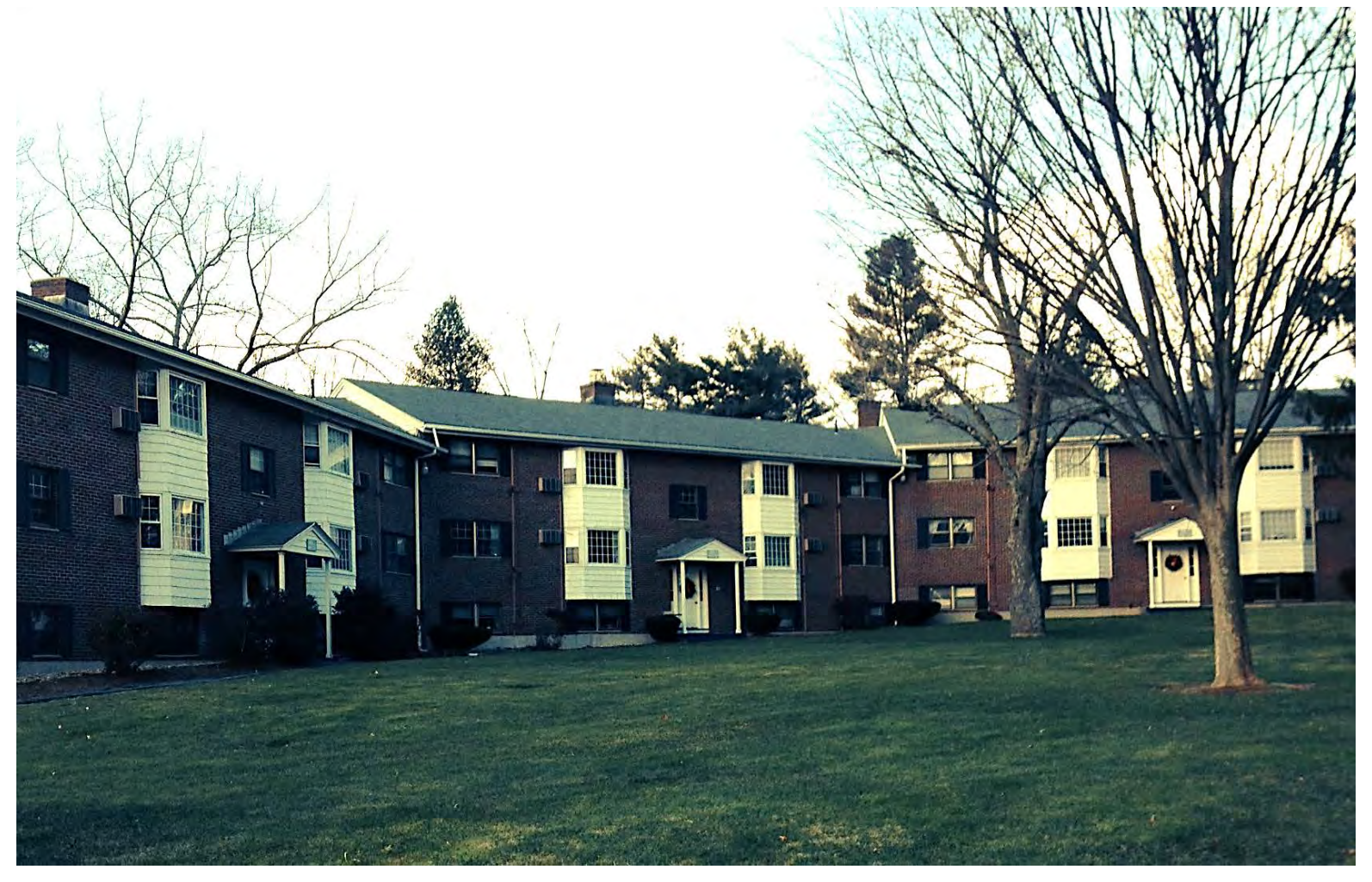
Yankee Village Condos – Townhouse Lane 3 Affordable Rental Units – DHCD ID 12