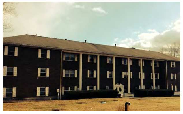
Prepared by the Regional Housing Services Office 2014