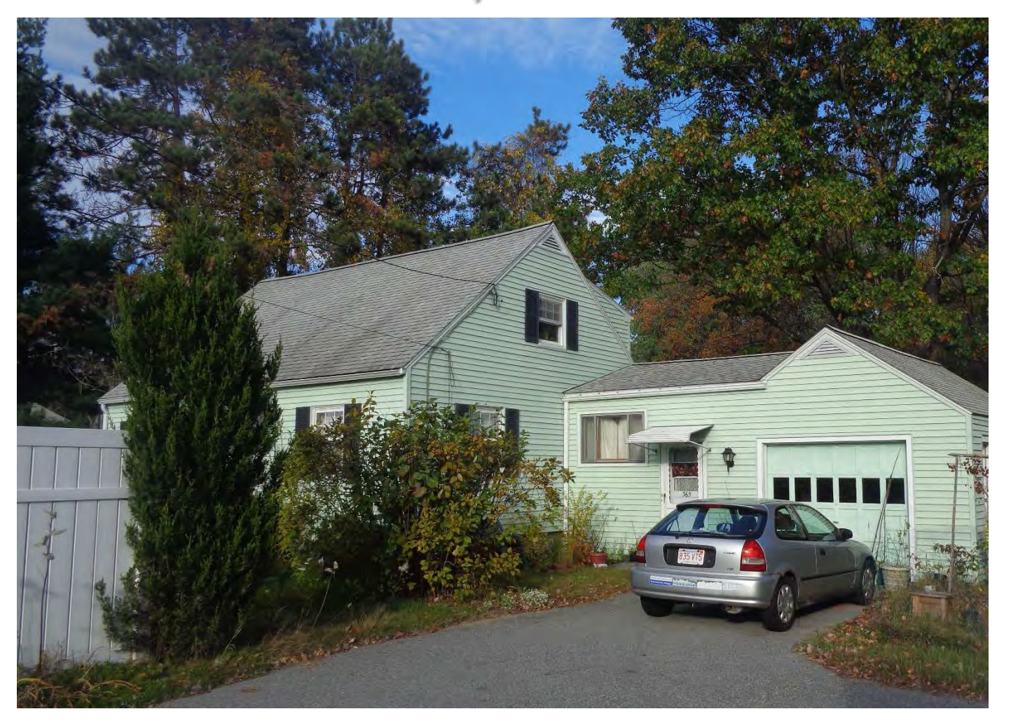
1 Affordable Ownership Unit DHCD ID 22