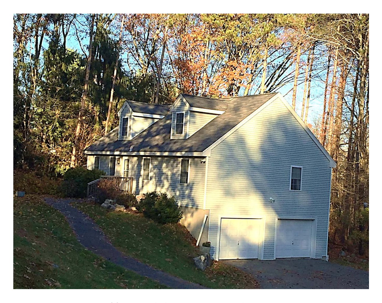
1 Affordable Ownership Unit DHCD ID 21