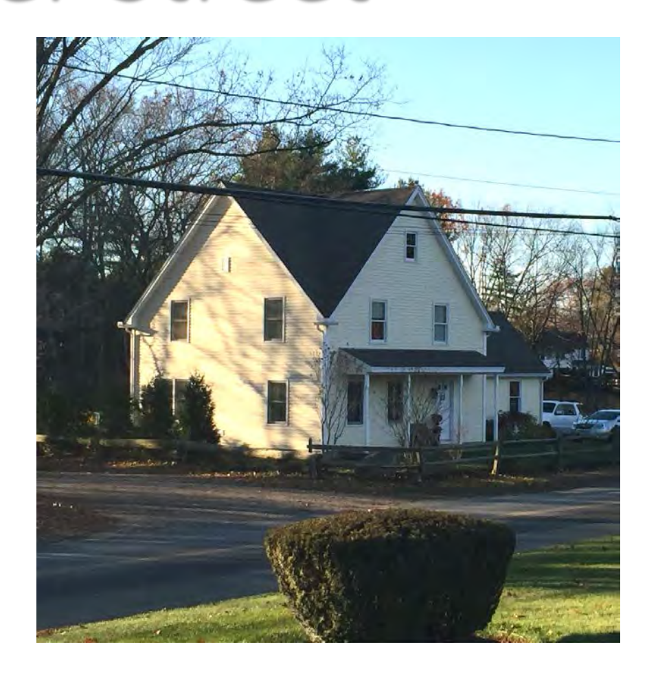
99 Parker Street 2 Affordable Ownership Units DHCD ID 9281