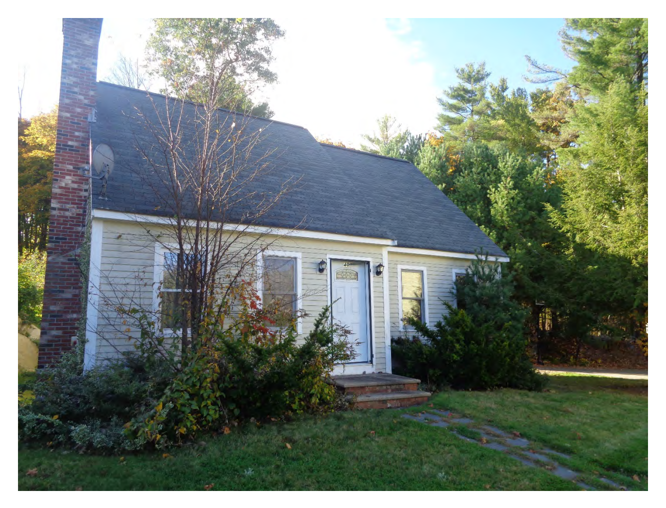
1 Affordable Ownership Unit DHCD ID 16