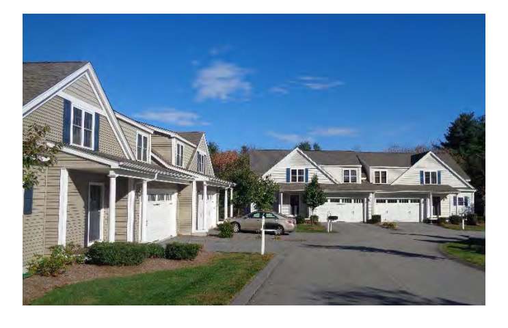
Prepared by the Regional Housing Services Office, 2014