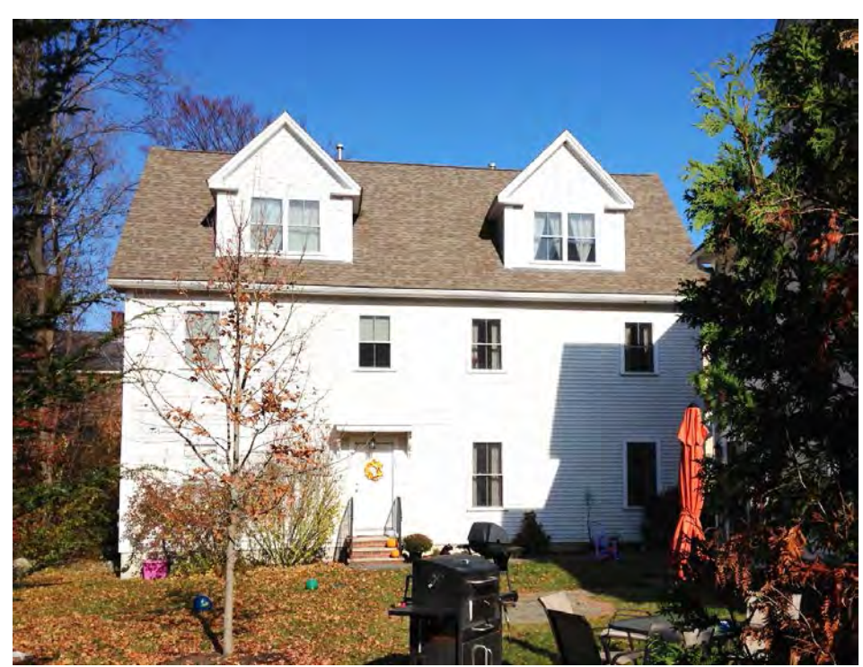
River Street 2 Affordable Ownership Units DHCD ID 7161