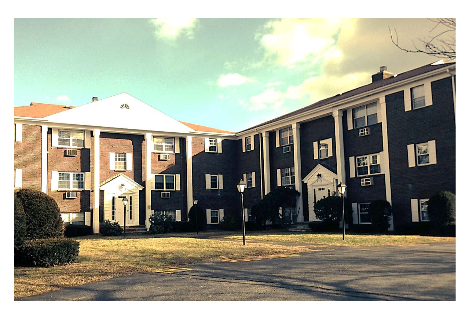
Parker Village Condos – Parker Street 4 Affordable Rental Units - DHCD ID 12