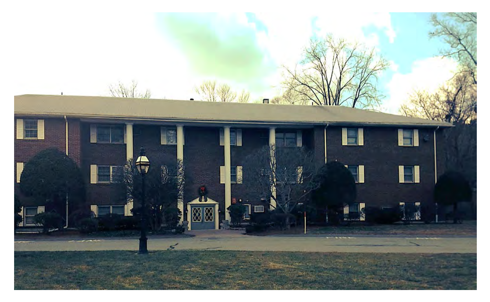
Pillar House I Condos – Great Road 1 Affordable Rental Unit - DHCD ID 13