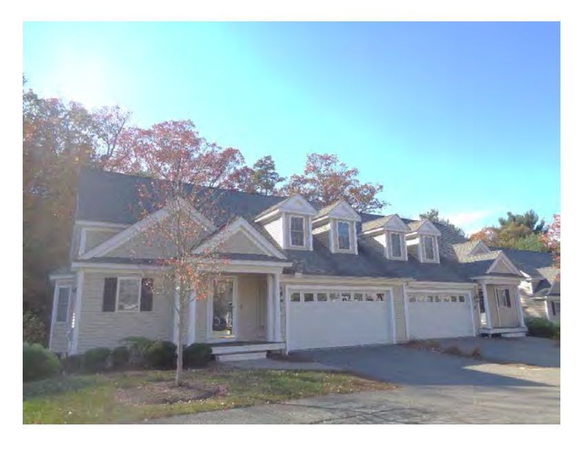
520 Main Street 3 Affordable Ownership Units DHCD ID 7159