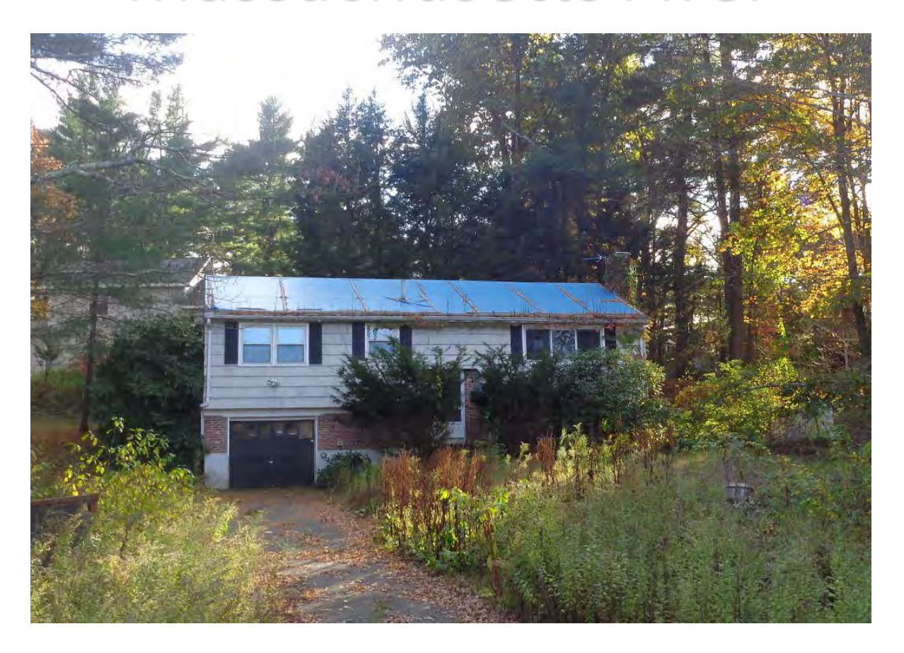
1 Affordable Ownership Unit DHCD ID 23