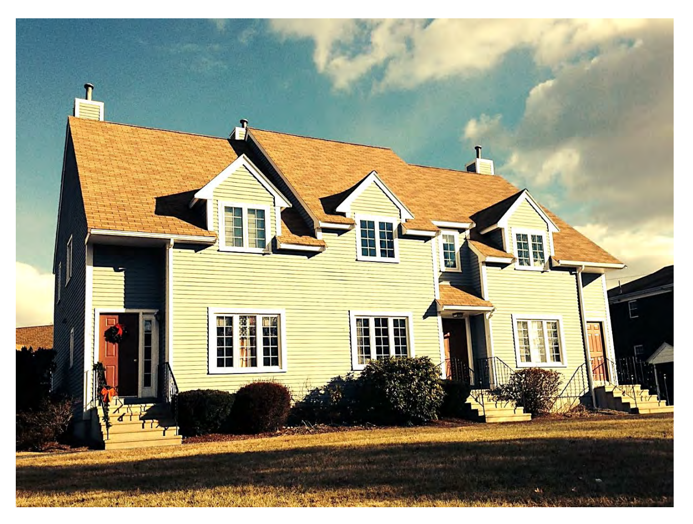
Rose Stone Village Condos – Parker Street 3 Affordable Rental Units - DHCD ID 13