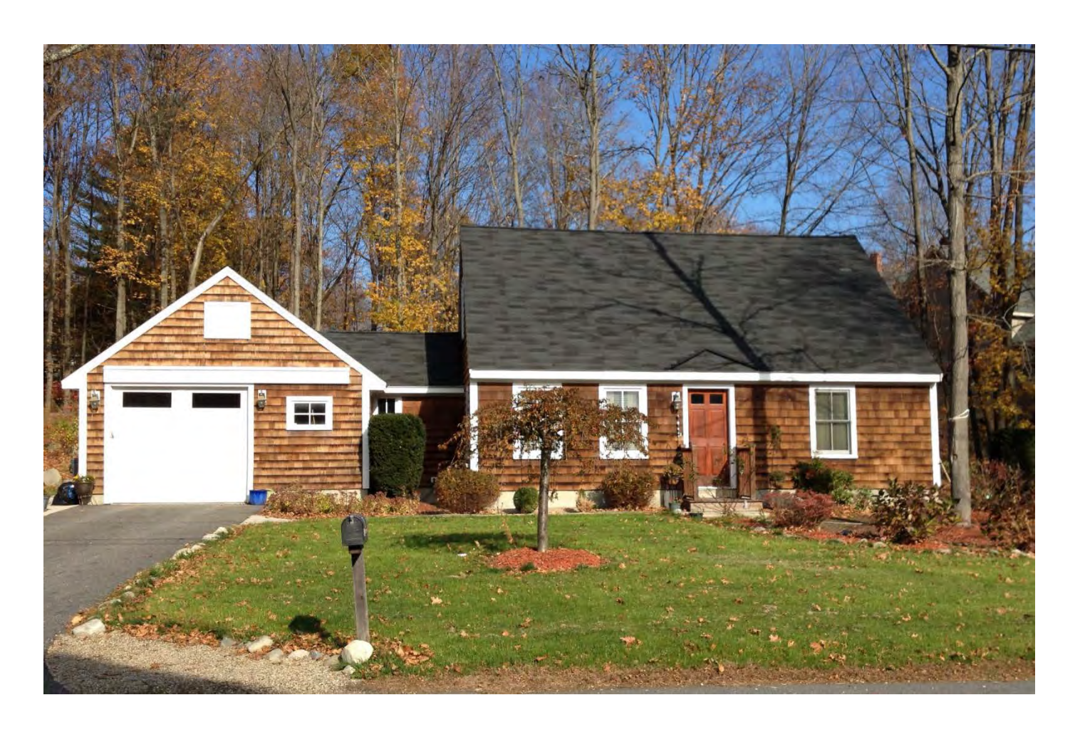
1 Affordable Ownership Unit DHCD ID 9072