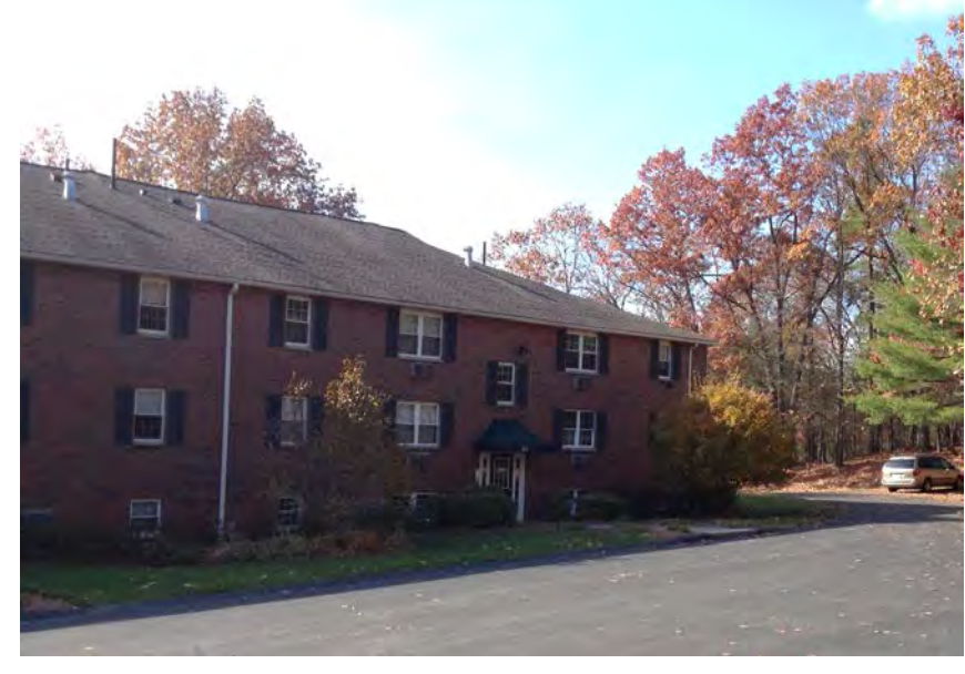
Wampus Avenue 2 Affordable Rental Units, DHCD ID 9092