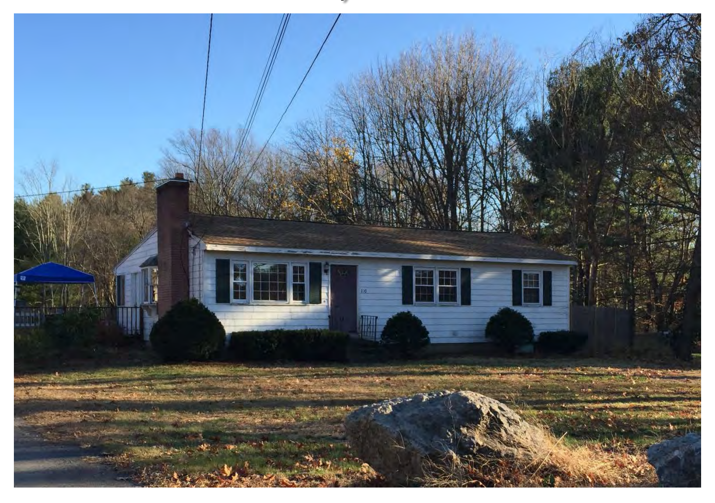
1 Affordable Ownership Unit DHCD ID 20