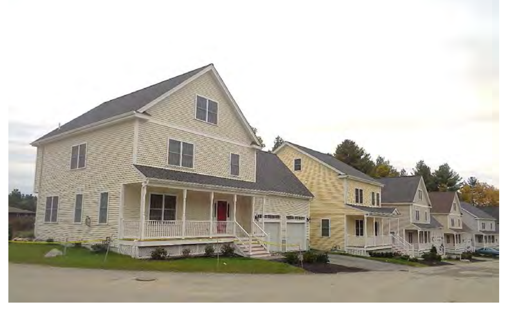
Great Road 2 Affordable Ownership Units DHCD ID 9576